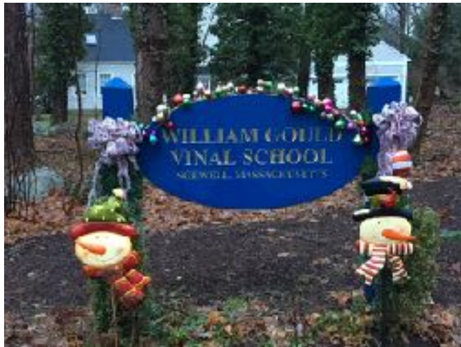
Thank you, Beautification Committee