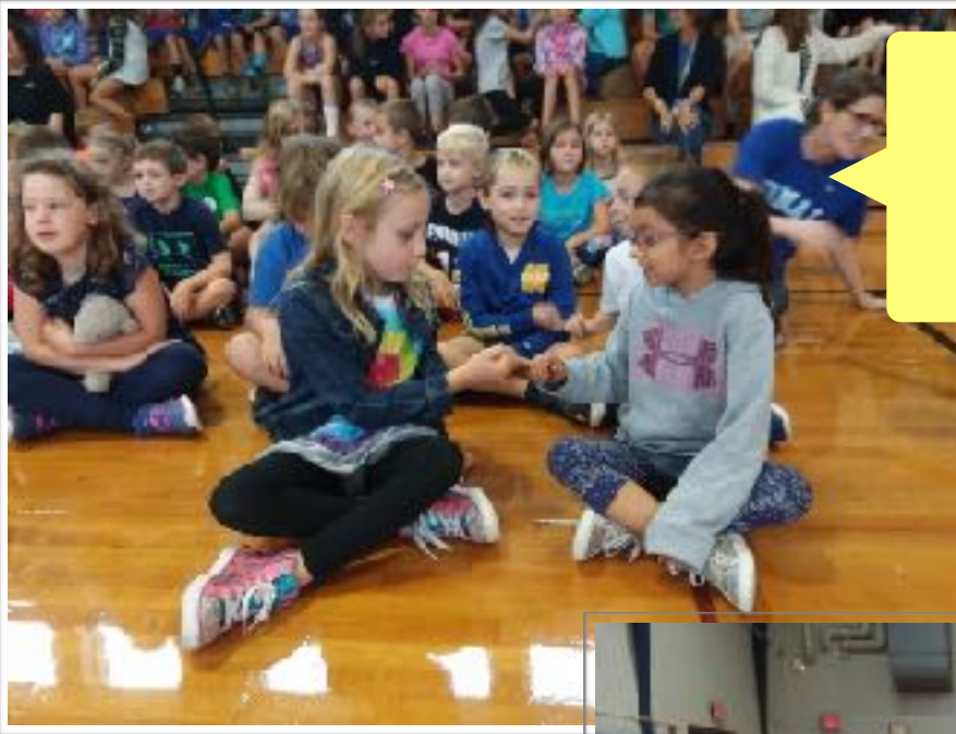
Greeting our friends