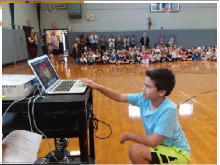
Working the wheel of classrooms