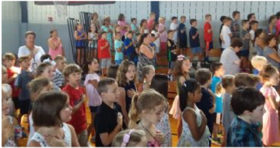
Saying the Pledge of Allegiance on the first day of school.